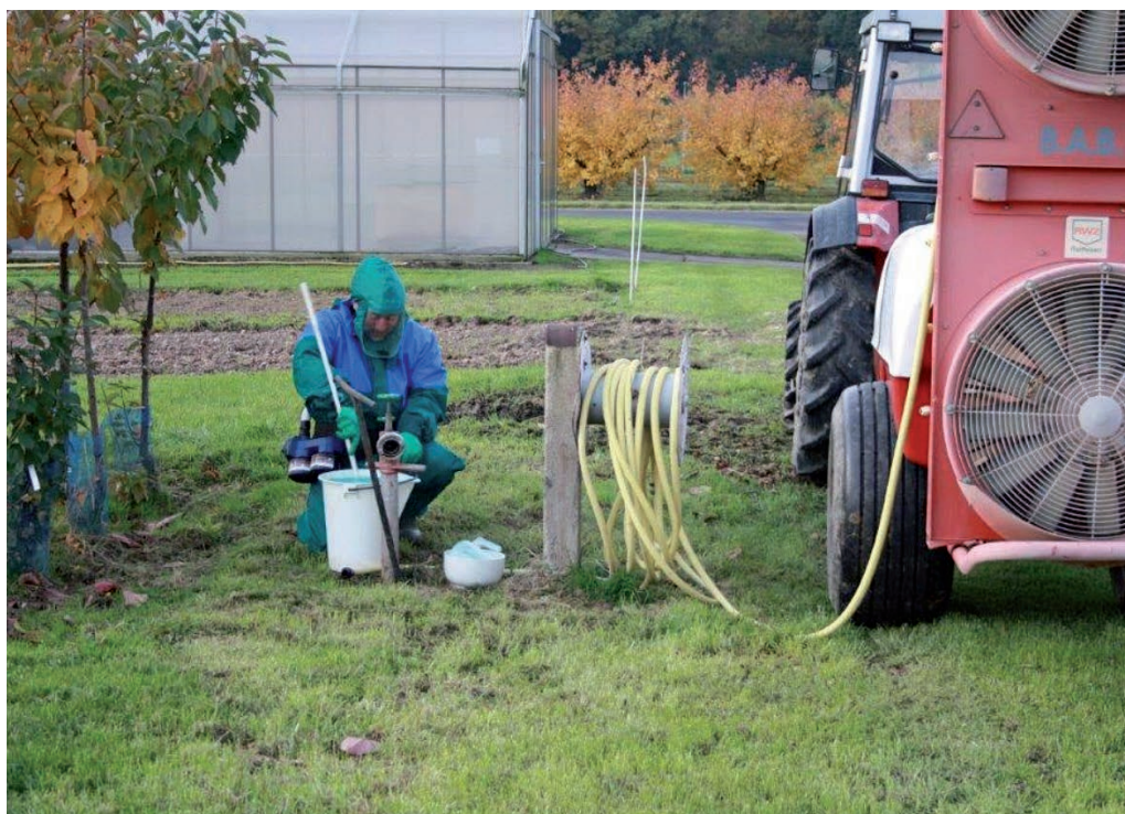
Appropriate protective clothing is important to ensure that no harmful components of plant protection products are absorbed

The German Federal Office of Consumer Protection and Food Safety (BVL), as the licensing authority for plant protection products, has increased its focus on the special importance of health protection. Since May 2018, certain requirements that reduce risks to the health of users, workers and uninvolved third parties to an acceptable level have been established as application regulations. Any violations of application regulations may be considered administrative offences by the competent state authorities and subject to a fine. As a result of the EU Control Regulation (Regulation (EU) 2017/625) which was enacted last year, the implementation of legal requirements for the use of plant protection products and user pro-