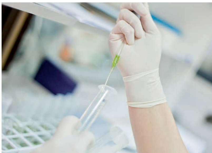
The laboratory of La Unión Corp. has had a QS approval for over a year