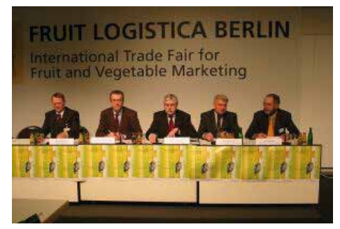
Press conference 2004

Active support for safe and high-quality food right from the start: the QS quality scheme for fruit, vegetables and potatoes is celebrating its tenth anniversary this year. The official foundation stone for the quality scheme was laid at the Fruit Logistica in Berlin in 2004 (see photo).